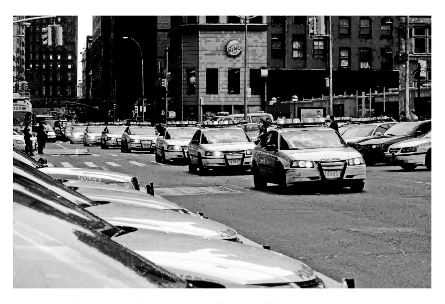
The "critical response vehicle surge," a fixture of the post-9/11 city. ( Photograph by Ramin Talaie , 2004; photo illustration by The New York Times )